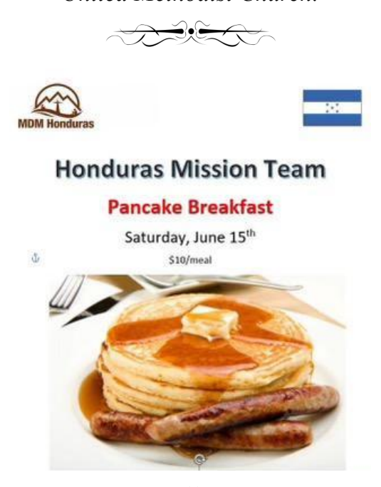
8 Am till 12 PM

*This event is free and open to the public, but we also gladly accept donations to benefit Hawley United Methodist Church.